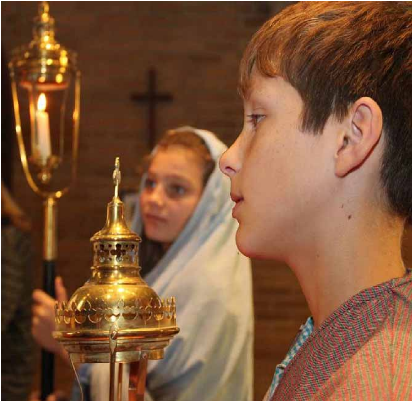
St. Alban's Christmas Pageant